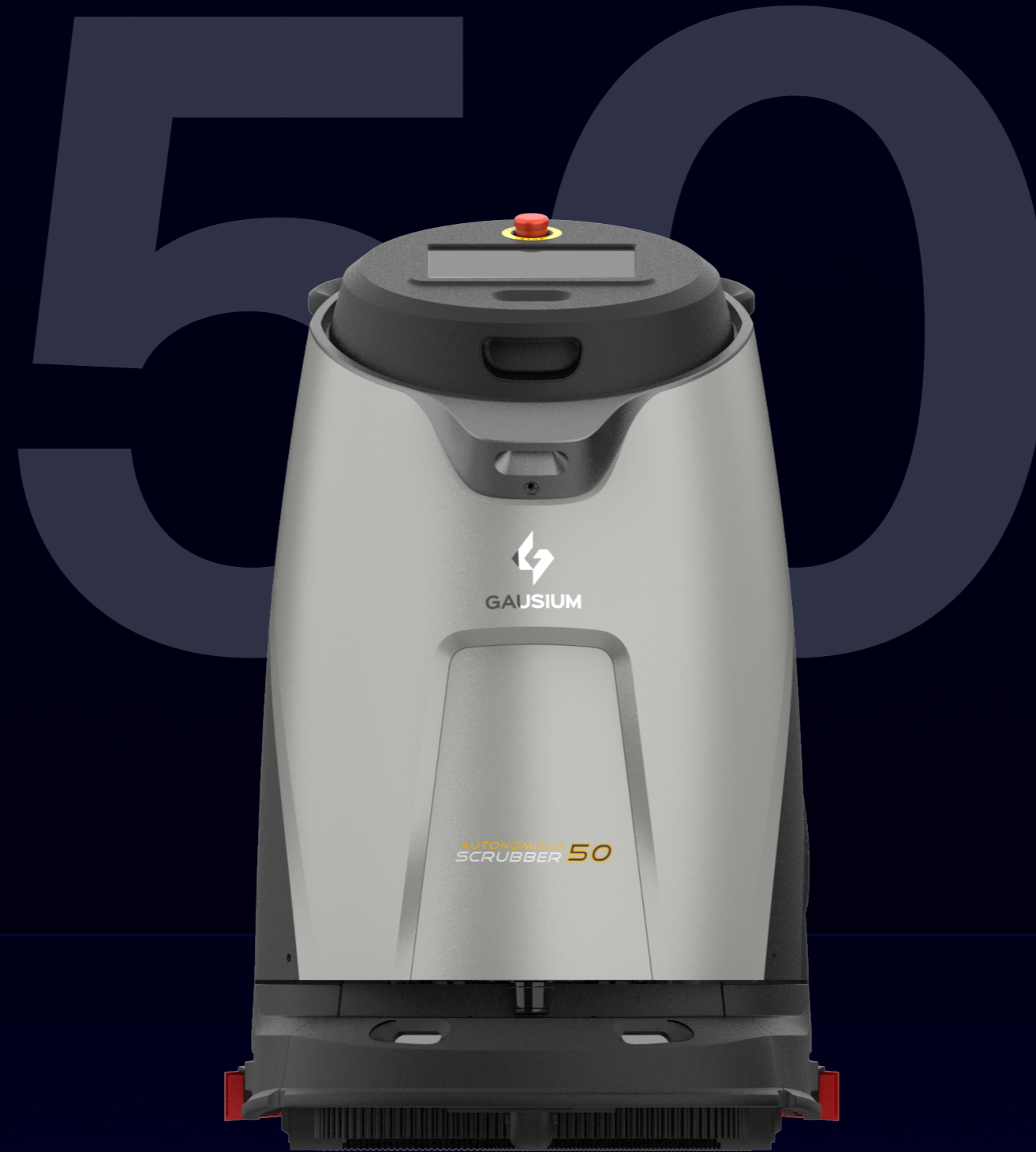
Scrubber 50 Pro AI-Powered Robotic Floor Scrubber